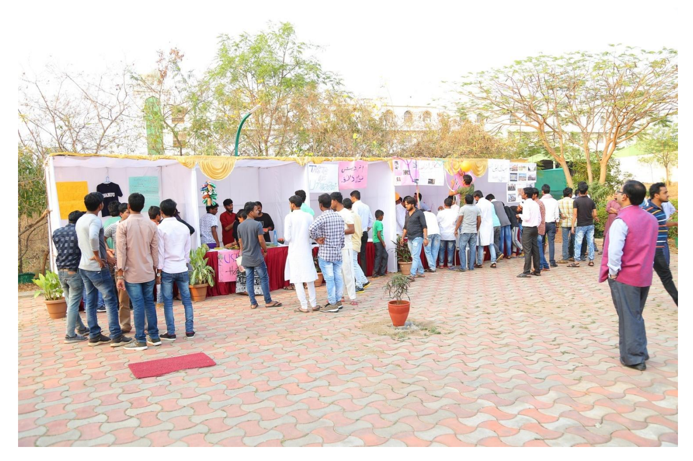
Cultural Stall of Kerala, West Bengal, Uttar Pradesh and Bihar