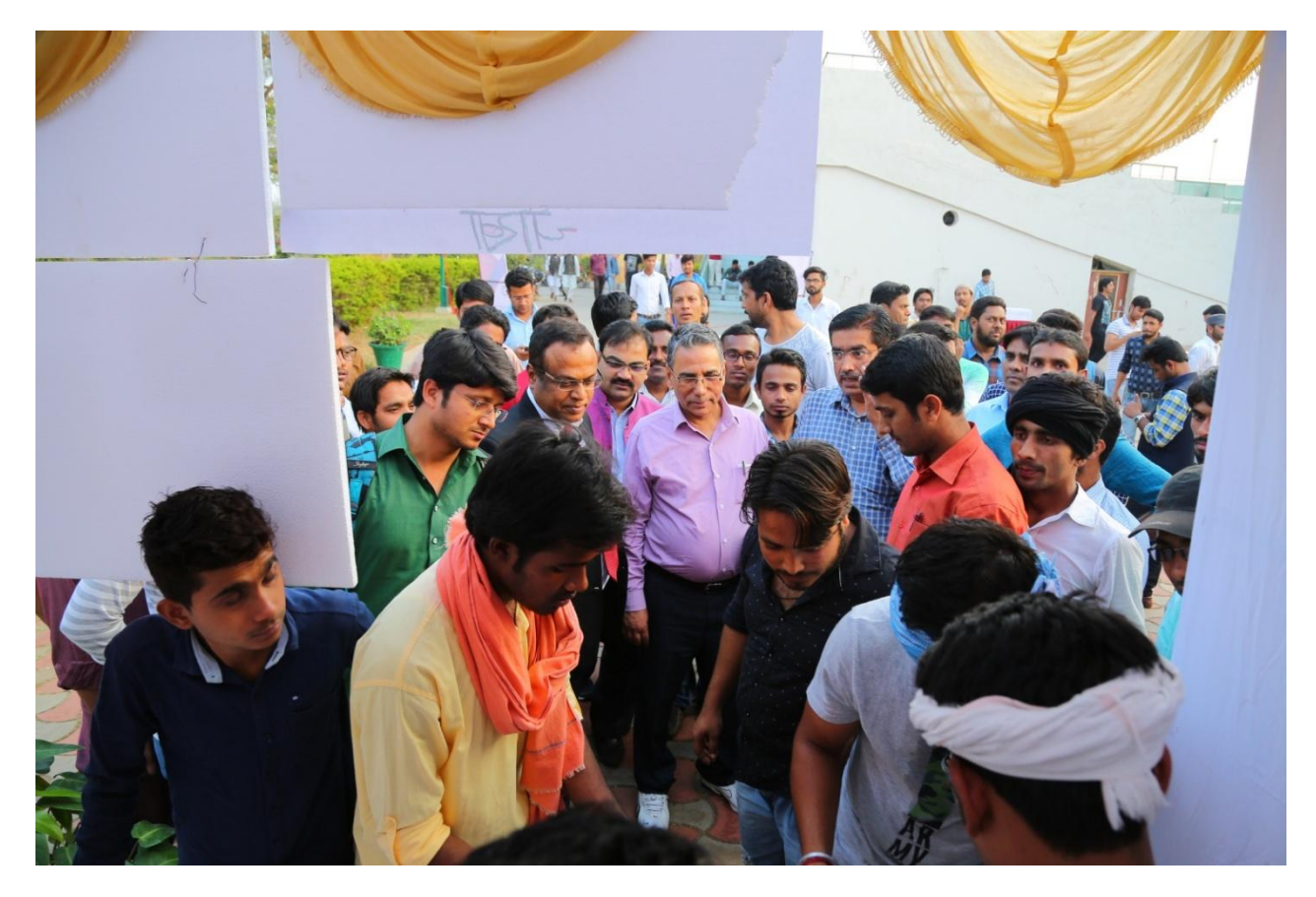
Cultural Stall by the Hostel Boarder's of Uttar Pradesh