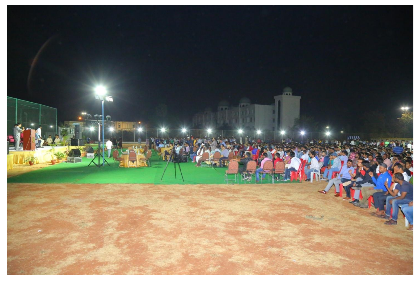
A view of the gathering of the students on the occasion of Annual Hostel Celebration, Boys Hostel – 2017-18.